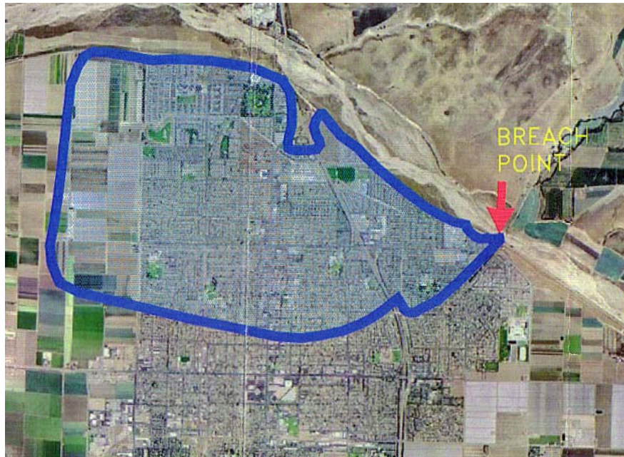
Exhibit 6. A levee breach near the Suey Bridge would flood a large portion of the City of Santa Maria.

District staff patrol the levee when the river is flowing. Two people patrol in a vehicle, with one driving and one looking for impending failure (using a spotlight at night). They drive the levee about once each hour, 24 hours per day, when the flow is heavy. After the river recedes they patrol twice each day. When a potential breach is spotted, rock is trucked in to reinforce the levee.