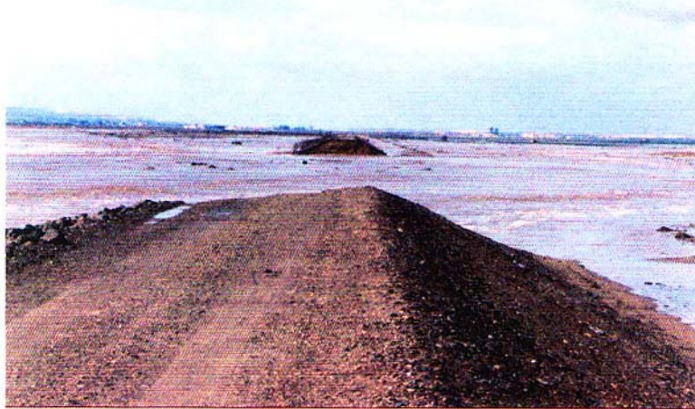
Exhibit 4. Photograph of the 1,000-foot breach in 1998 that flooded adjacent farmland.

Public officials expressed concern to the Grand Jury that there is a serious risk of such a breach adjacent to the City of Santa Maria. The Grand Jury visited the levee to see the situation first-hand, reviewed a report prepared in January 2006 by the District with technical assistance from Penfield & Smith Engineers, Inc., and interviewed officials in the Public Works Departments of the County and the City of Santa Maria.